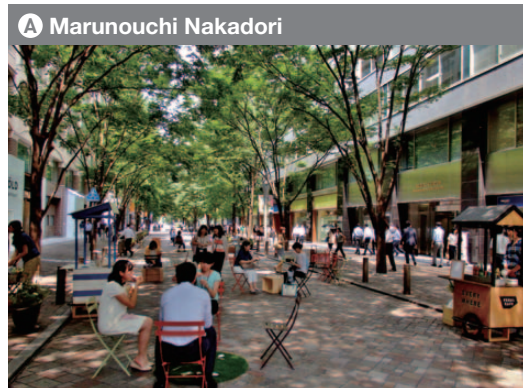
A Marunouchi Nakadori Pedestrian zone times: Weekdays: 11:00 a.m. to 3:00 p.m. Weekends and holidays: 11:00 a.m. to 5:00 p.m.