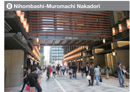
B Nihombashi-Muromachi Nakadori Pedestrian zone times: Weekdays, weekends and holidays: 11:00 a.m. to 8:00 p.m.