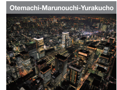
Otemachi-Marunouchi-Yurakucho Japan's first business district. Recent years have seen a transformation of this area into a lively, bustling space.

Tokyo has numerous business centers where the headquarters of many domestic and international enterprises are found. Each with its respective color, as one area faces renewal, other areas go on functioning to ensure that the economic vitality of Tokyo never stops. Their seamless functions support the growth of Tokyo.