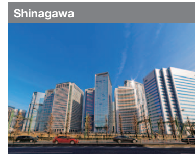
Shinagawa Located near Haneda Airport, developments are underway to turn this area into a center of international exchange.