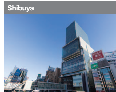
Shibuya This dynamic center of culture is also attracting IT ventures.