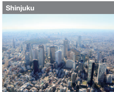
Shinjuku After a half-century of development on the site of the former Yodobashi water purification plant, the business district is entering a period of renewal.