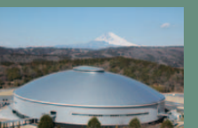
29 Izu Velodrome