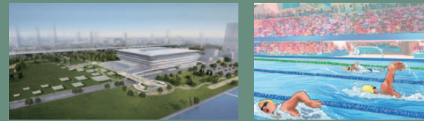
19 Olympic Aquatics Center*

The facilities will continue to be used effectively beyond the Games as sites for competitive sports, playing and watching sports, training young athletes, and other purposes.