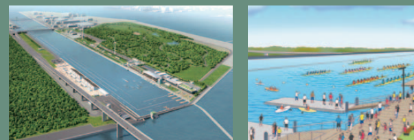
16 Sea Forest Waterway*

*The images above are artist renderings of facilities planned for the Games as of October 2015.