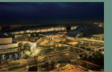
27 Makuuhari Messe