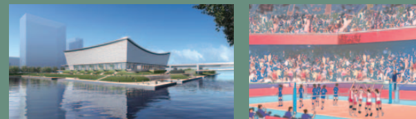
8 Ariake Arena*