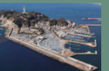
28 Enoshima Yacht Harbour