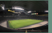
31 Sapporo Dome