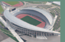
32 Miyagi Stadium