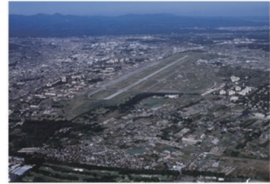
Yokota Air Base

In Tokyo, there are seven U.S. military installations (facilities and areas provided to the U.S. forces), including Yokota Air Base, where the headquarters of the U.S. Forces in Japan are located. Combined, they occupy approximately 1,600 hectares.