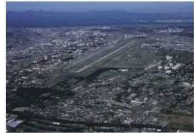
Yokota Air Base

In Tokyo, there are seven U.S. military installations (facilities and areas provided to the U.S. forces), including Yokota Air Base, where the headquarters of the U.S. Forces in Japan are located. Combined, they occupy approximately 1,601 hectares.