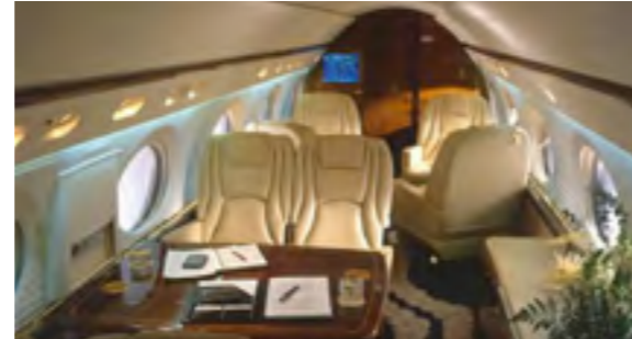
(Examples of Business Aircraft©Gulfstream Aerospace Corporation)