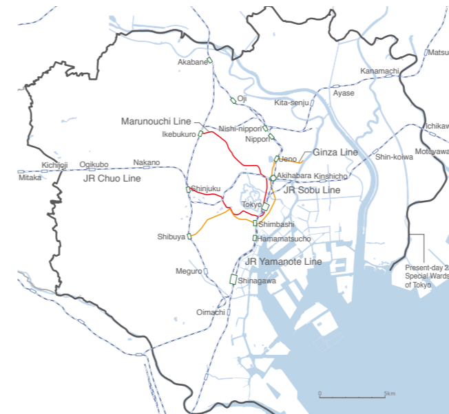
Subway network in 1960