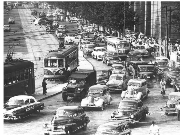
Popularity of owned cars (early 1960s) The number of automobiles in Tokyo, which was just 200,000 in 1954, continued to grow from the late 1950s to the 60s, tripling in nine years from 490,000 vehicles in 1959 to 1.54 million vehicles in 1967. Viewing this by type of vehicle, cargo vehicles increased 2.7-fold and passenger cars 5.7-fold, and the use of automobiles spread not only for business use, but for commuting and leisure activities as well.

With the spread of automobiles, streetcars became a hindrance to road traffic, and so the subway system came to be constructed to replace them. Through expansion of transportation capacity for commuting into the city center and enhanced convenience through mutual direct operations with other railway operators, the subway system supported the lives of the Tokyo citizens as a new mode of transport.