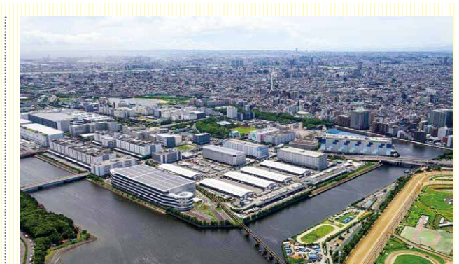
South logistics park