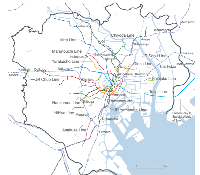
Subway network in 1980