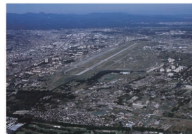
Yokota Air Base

In Tokyo, there are seven U.S. military installations (facilities and areas provided to the U.S. forces), including Yokota Air Base, where the headquarters of the U.S. Forces in Japan are located. Combined, they occupy approximately 1,600 hectares.