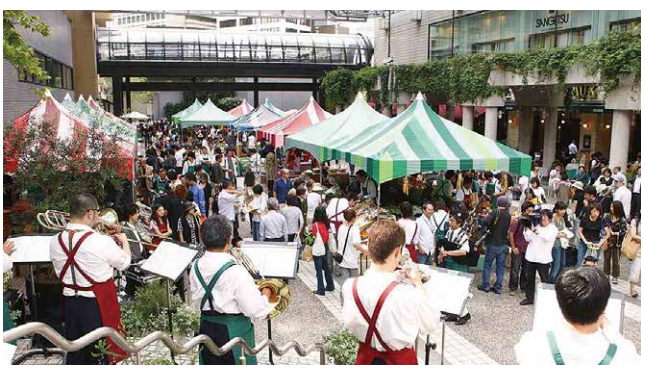
Events held in squares, atriums, and other spaces open to the public (left) Roppongi Hills (right) Futako Tamagawa Rise