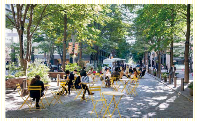
Use of road space on Marunouchi Naka-dori Street

• The National Strategic Special Zone system spearheaded by the Cabinet Office promotes regulatory reform both comprehensively and intensively within the special zones with the goal of strengthening the international competitiveness of industries and promoting the creation of