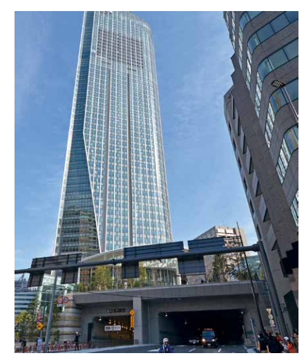
Multi-Level Road System

Redevelopment of the Toranomon area was delayed for many years due to factors including the high price of land and the large number of residents who wished to continue living in the area. At the same time, construction of Ring Road No. 2 had not progressed, so the redevelopment plan was set aside for an extended period of time and Toranomon remained an area with many small, aging buildings (left). To overcome this situation, systems for district planning and multi-level roads were established in 1989 to allow the ring road to be integrated with buildings located directly above and below the road. With these new systems in place, the Ring Road No. 2 Shimbashi-Toranomon District Category 2 Urban Redevelopment Project got under way in coordination with the Ring Road No. 2 (right) construction project. Today, the Toranomon area, home of many embassies and foreign companies, continues to grow as