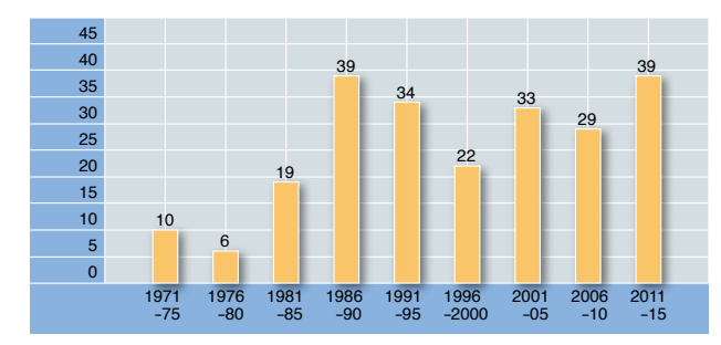
Change in number of urban redevelopment projects determined as Tokyo's city planning projects