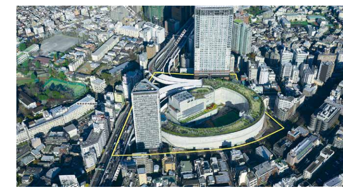
Ohashi Junction site (after construction)

10—The turning point in urban redevelopment