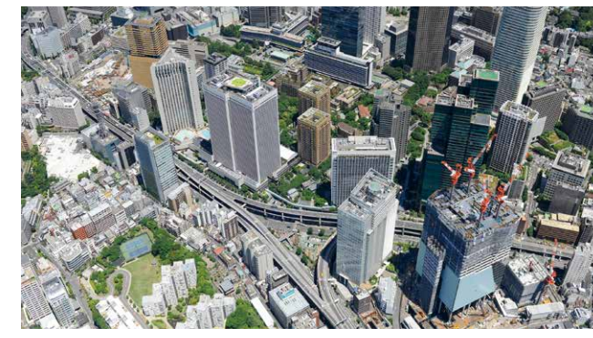
ARK Hills after construction