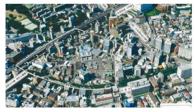
Ohashi Junction site (before construction)

In Harumi, Chuo-ku, an urban redevelopment project led to the birth of Harumi Island Triton Square, a new town balancing the three urban functions of work, residence, and leisure on a 10-hectare site. In the late 1950s to early 60s, it was a mixture of the Harumi Danchi public housing development built by the Japan Housing Corporation (currently the Urban Renaissance Agency) and warehouses and other logistics related facilities. But with the rising trend for reconstruction of housing developments and more effective use of land set aside for logistics facilities, it was positioned as a district requiring unified redevelopment. Community development was promoted through organizations of stakeholders, such as the Association to Improve Harumi, which was established in 1984, and the Harumi 1-chome District Development Council and Harumi Corporation established in 1988.