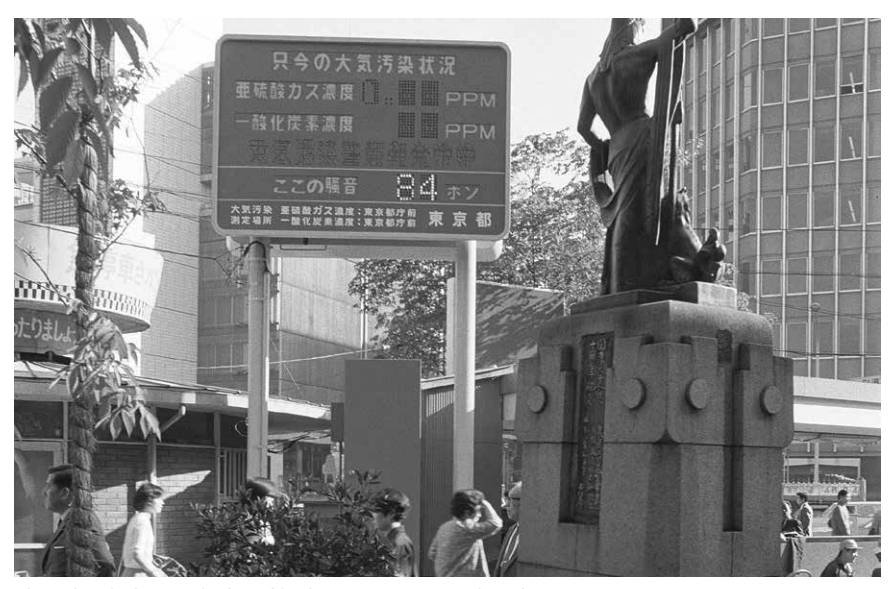
Photochemical smog signboard in the 1970s on a street in Tokyo

Change over the years in annual average figures for sulfur dioxide in the air in the ward area (Chiyoda-ku) The Tokyo Metropolitan Pollution Prevention Ordinance served to improve environmental problems by leading many local governments that had the same problems. After the enactment of the ordinance, sulfur dioxide in the air in Marunouchi was reduced from 7.7pphm in 1966 to 2.6pphm in 1972 (1pphm=0.0001%). Prepared from "Change in Air Pollutants." Bureau of Environment, Tokyo Metropolitan Government.