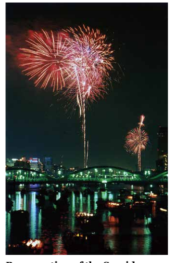
Resurrection of the Sumida River fireworks (1978)

With post-war economic growth, Sumida River became increasingly polluted, resulting in cancellation of the fireworks event from 1961. Stakeholders worked together to clean up Sumida River, including development of sewers mainly in basins receiving factory wastewater, and were able to significantly improve water quality.