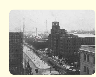
Tokyo City Public Hall, which would go on to become Hibiya Public Hall (pictured in the center)

His publications include Sekai no machikado kara Tokyo wo kangaeru (Considering Tokyo from the world's street corner). Fuiiwara-Shoten: Shosetsu Goto Shinpei (Goto Shinpei: A novel), Gakuyo Shobo; and Toshi no Governance (City governance), Sanseido