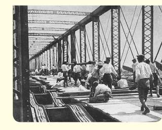
Just after the Great Kanto Earthquake. The army makes emergency repairs to the deck of the Azuma-bashi Bridge, which was de-