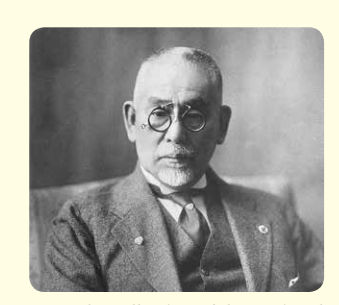
As Minister of Home Affairs, Goto led the reconstruction of Tokyo after the Great Kanto Earthquake.