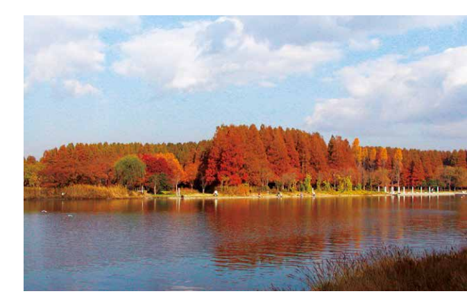
Present-day Mizumoto Park