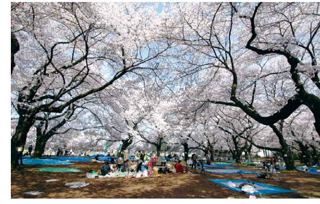
Present-day Koganei Park