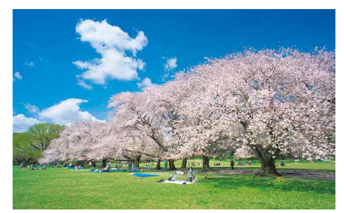
Present-day Kinuta Park