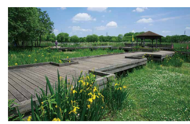
Present-day Toneri Park