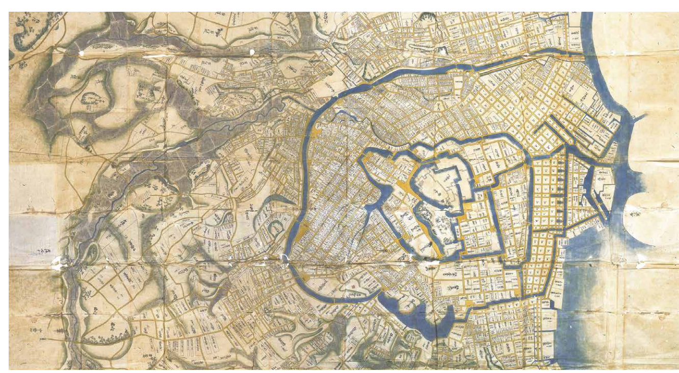
Kan-ei Edo Zenzu (Total Plan of Edo)

The oldest existing map of Edo, which shows the city in the early Edo period before the Great Fire of Meireki. The built-up area of the city spread mainly over the west side of Sumida River.