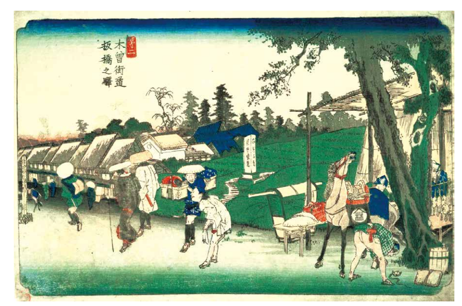
Itabashi-shuku Dai 2 Kiso-kaido Itabashi no eki (The (Sixty-nine Stations of the) Kisokaido Road: No. 2, Itabashi Station)

Nihombashi, which was set as the origin of the five major roads (Tokaido, Koshu-kaido, Oshu-kaido, Nikko-kaido, Nakasendo), was bustling with people.