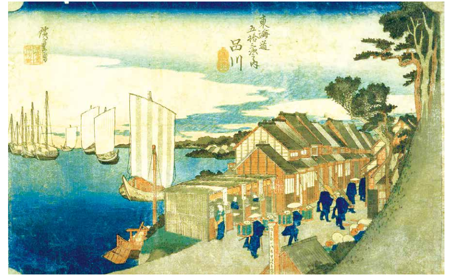
Shinagawa-shuku Tokaido gojusantsugi Shinagawa, hinode (Fifty-three Stations of the Tokaido Road: Shinagawa: Sunrise) From the collection of the National Diet Library.

A post station located along the Koshu-kaido road (currently around the area from Yostuya 4-chome to Shinjuku 3-chome, Shinjuku-ku).