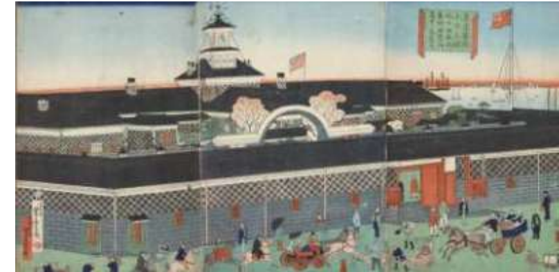
Tsukiji Hotel exterior

TMG will henceforth hold discussions with the Operator and others to brush up the plans proposed by the Operator and promote urban development that will lead to the sustainable growth of Tokyo.