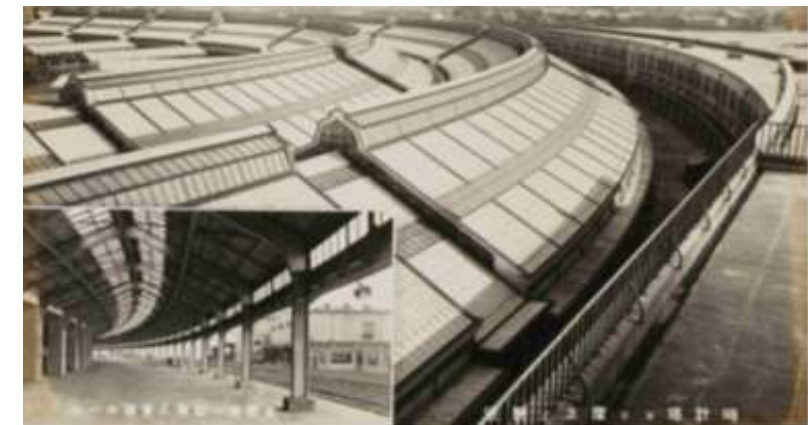
Former Tsukiji Market